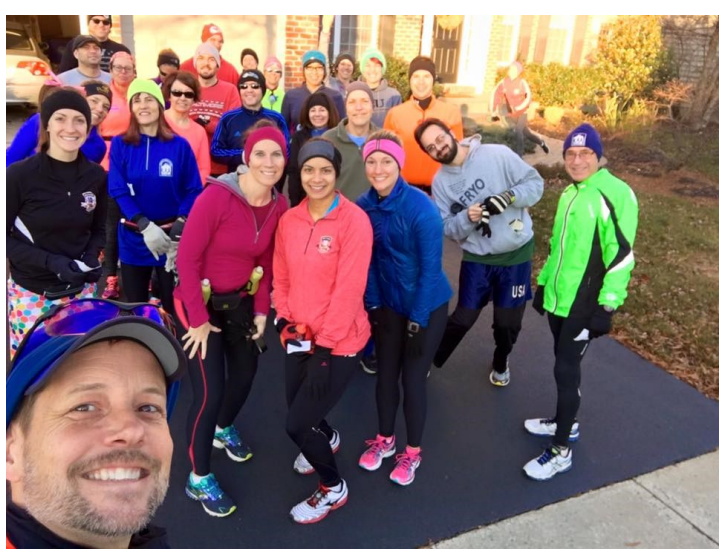
A whole lot of Steeplechasers